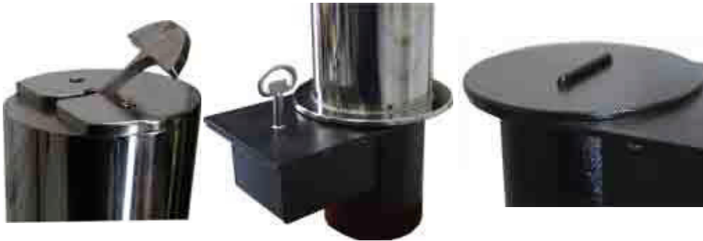
Recessed Pull handle in its operating position