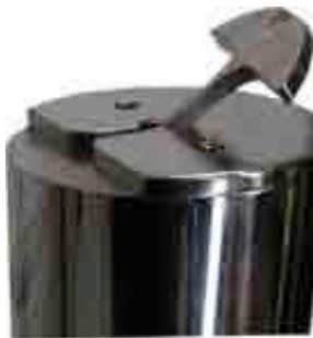
Bollard with pull handle

We inventory manual stainless steel bollards most commonly used and available for immediate delivery. We custom manufacture bollards in quantities over 50.